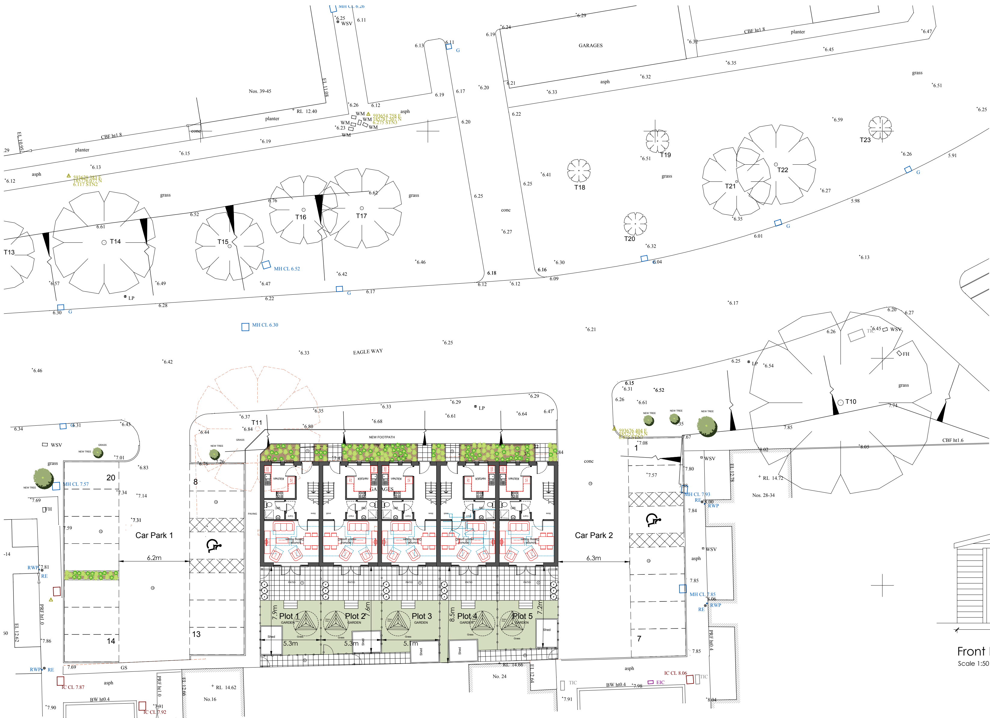
Proposed Tree Plan 1:200